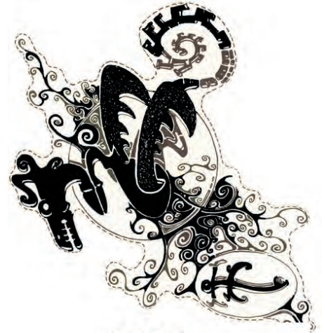
2D Slice Franco Muscarella

There is a sense of tension and energy like a coiled spring within the form. The inter relationship of the multiple small units creates a sense of an organic whole. There is no correspondence to any recognizable object. Yet looking at the work and letting it settle into your mind, there is much to admire. First is the craftsmanship, second is the sense of forms, and third is the way that all the component parts combine to create a sense of dynamic energy even though it is a stationary object. What we have then is a way of looking that lets the viewer appreciate the work for what is there. No effort is made to translate it into anything outside of the work itself. Thus the question should not be “Is there a Rosetta Stone for contemporary art?” but rather “What approach can we take to appreciate contemporary art?”