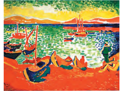
Boats at Collioure's Harbor by Andre Derain

We navigated the brackish, beige stairs to the second floor. We turned the corner. Instantly we were seized by the fabulous reds and oranges, blues and brilliant yellows, turquoise and purples that these men made into their joyous palettes that had caused them to be called wild beasts or Les Fauves in the early 1900s. Their passion grabbed our faces and kissed our eyes over and over again until we were soon gasping, "Look at that! Have you ever seen that color before?" We were pulling each other from painting to painting. Very soon, our tired faces were transformed to that special clarity of wonder and renewal of being in color.