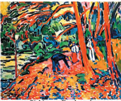
Picking up Deadwood by Maurice de Vlaminck

People tell me I have a joyous palette. I do. Color has power that is beyond understanding until you see its effects. The Fauve Landscape Exhibit at the Metropolitan Museum of Art in New York in 1991 was a perfect example of this transforming power. The night was bitterly cold and rainy. By some miracle we found parking on the street and traffic had not been terrible, but we were all really uncomfortable and exasperated by the time we got rid of our coats and umbrellas. My husband, a stoic museum-goer, even at the best of times was with people he did not care for and the evening was looming into never-ending tedium for him. I could see it clearly. He was just about to not say a word.